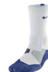
143 White/Game Ryl