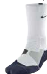
144 White/Midnight Navy