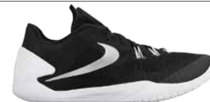
001 Black/Metallic Silver-White