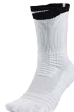
101 White/White/(Pure Platinum)