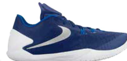
401 Mid Navy/Met Silver-White-Pht Blue