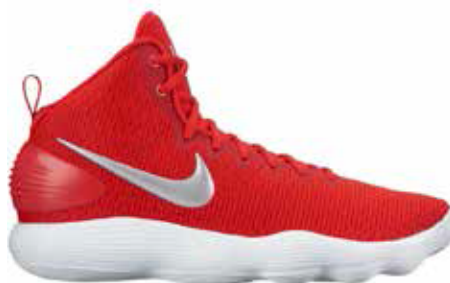
600 University Red/White