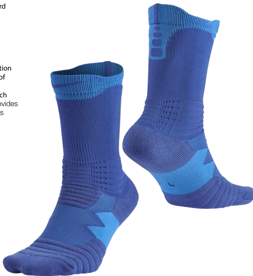
480 Game Royal/Photo Blue/(Game Royal)