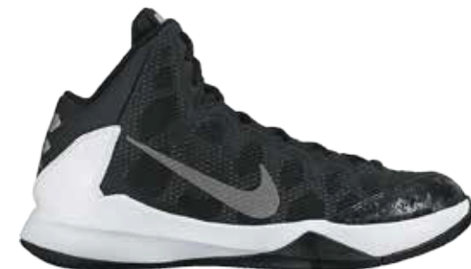
002 Black/Metallic Silver