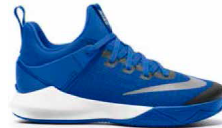
400 Game Royal/White