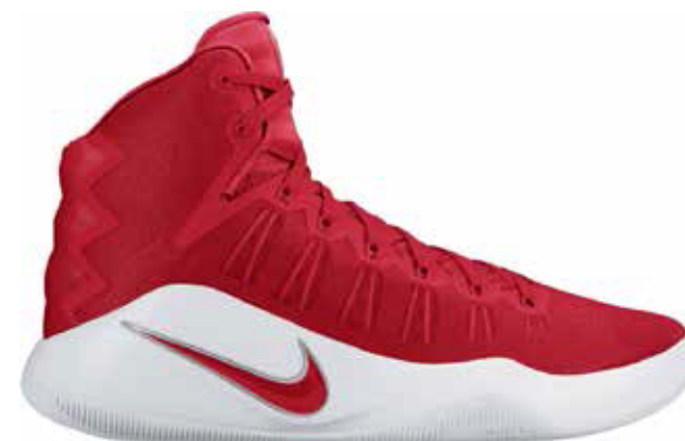
662 University Red/Uni Red-White