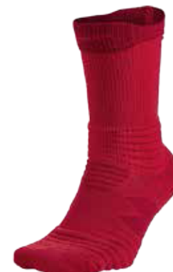
657 University Red/Gym Red/(University Red)