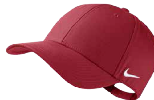
657 University Red//White