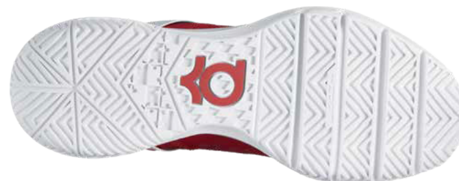
616 Bright Crimson/White