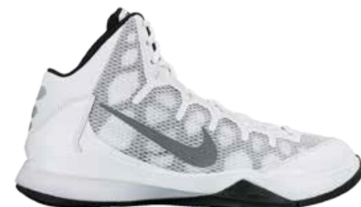
100 White/Metallic Silver-Black