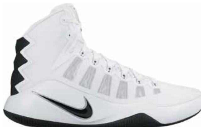
100 White/Black-Met Silver