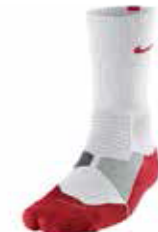
160 White/Varsity Red