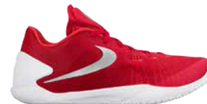
601 Uni Red/Met Silver-White-Bright Crimson