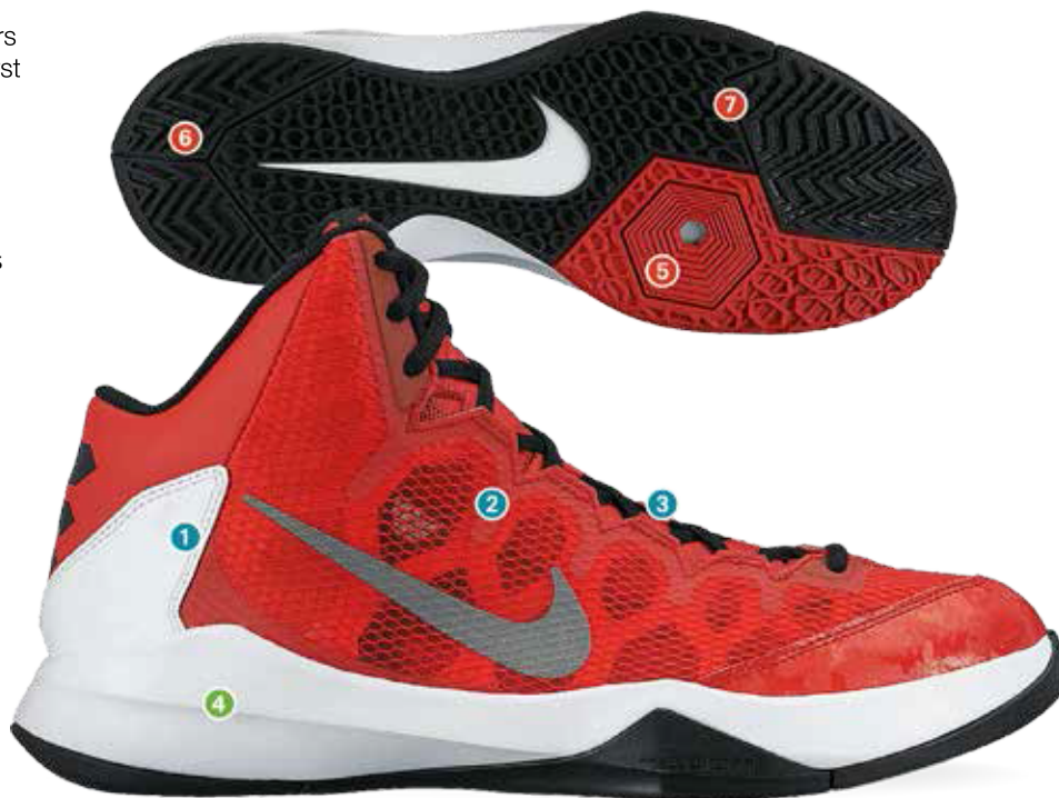
601 University Red