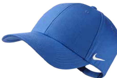
463 Royal Blue//White