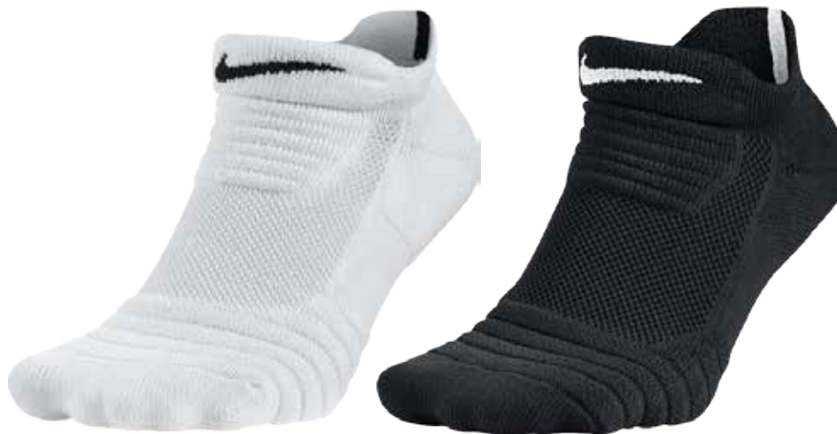
101 White/White/(Pure Platinum)