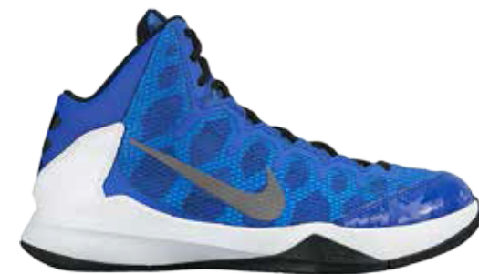
401 Game Royal/Metallic Silver-White-Blue Hero