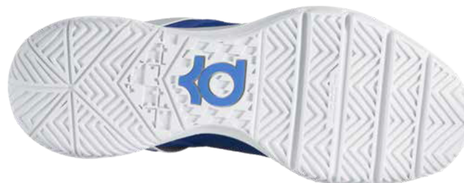
411 Game Royal/White