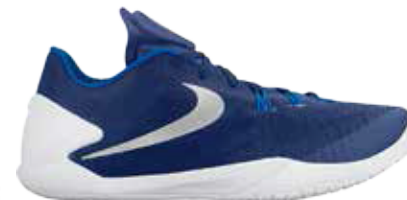
401 Mid Navy/Met Silver-White-Pht Blue