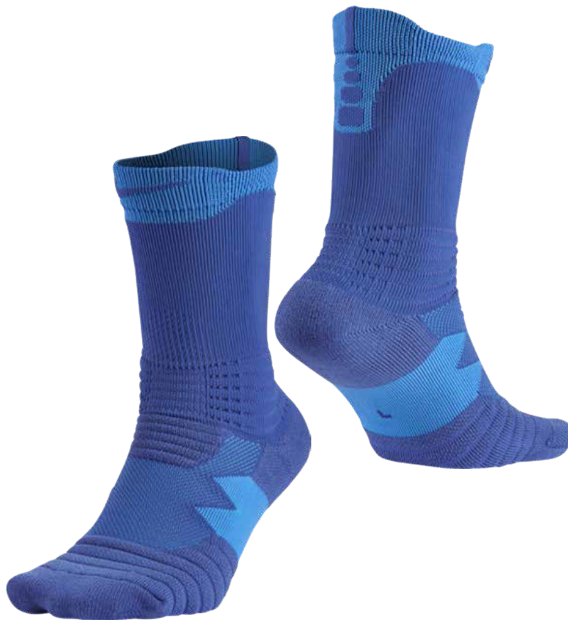
480 Game Royal/Photo Blue/(Game Royal)