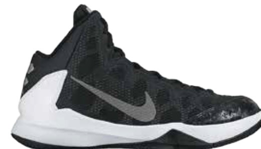
002 Black/Metallic Silver