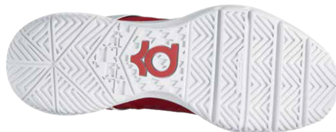
616 Bright Crimson/White