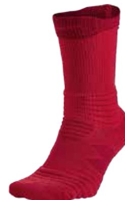
657 University Red/Gym Red/(University Red)