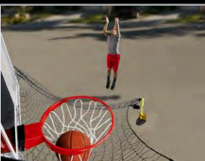
Rapid Fire 2.0