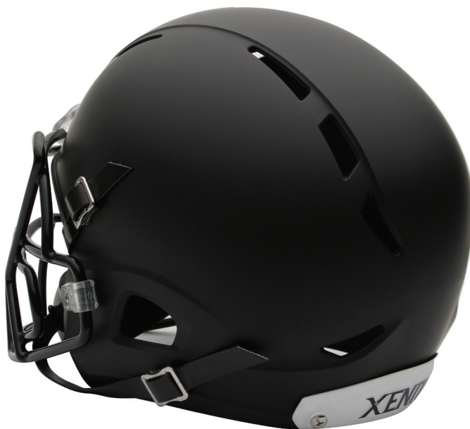
SERIES I COLOR: MATTE BLACK 01002