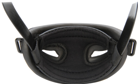
HYGENIC ANTIMICROBIAL LINER