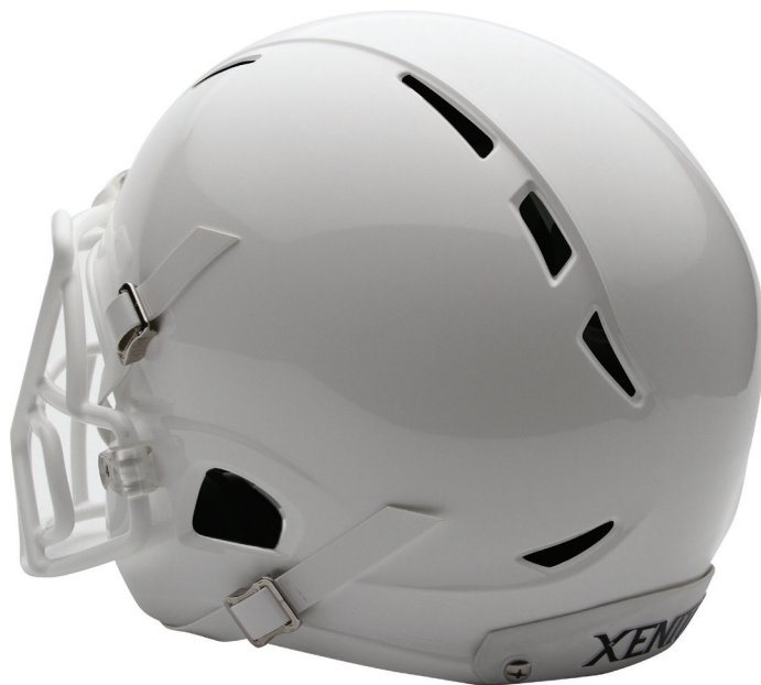
INJECTED COLOR: WHITE 03000

PRICES WILL VARY DEPENDING ON THE COLOR SERIES.