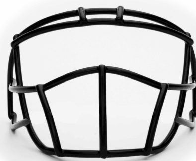
PRIDE AVAILABLE IN SMALL