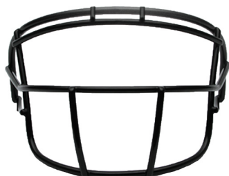
XRS-21 AVAILABLE IN SMALL

EACH STYLE CAN BE USED WITH ALL XENITH HELMETS, EXCEPT SIZE SMALL ONLY FITS WITH XRS-21.